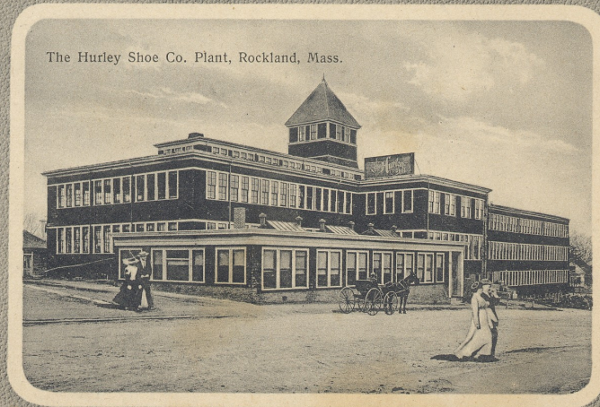
The Hurley Shoe Co. Plant, Rockland, Mass.