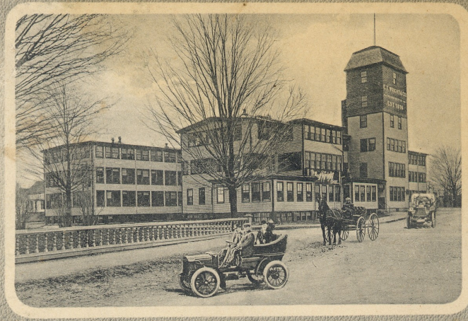
E. T. Wright & Co. Shoe Factory, Rockland, Mass.