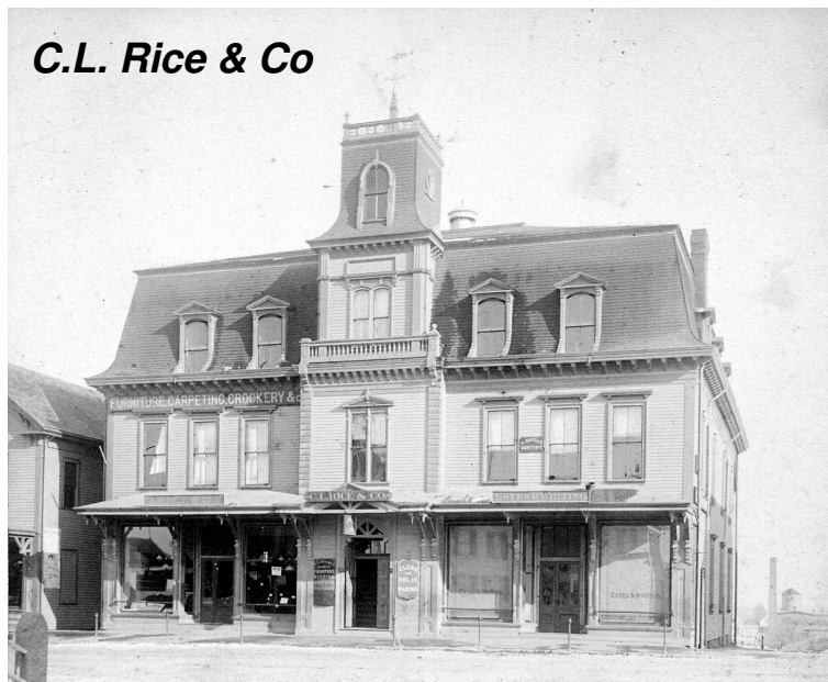
C.L. Rice & Co