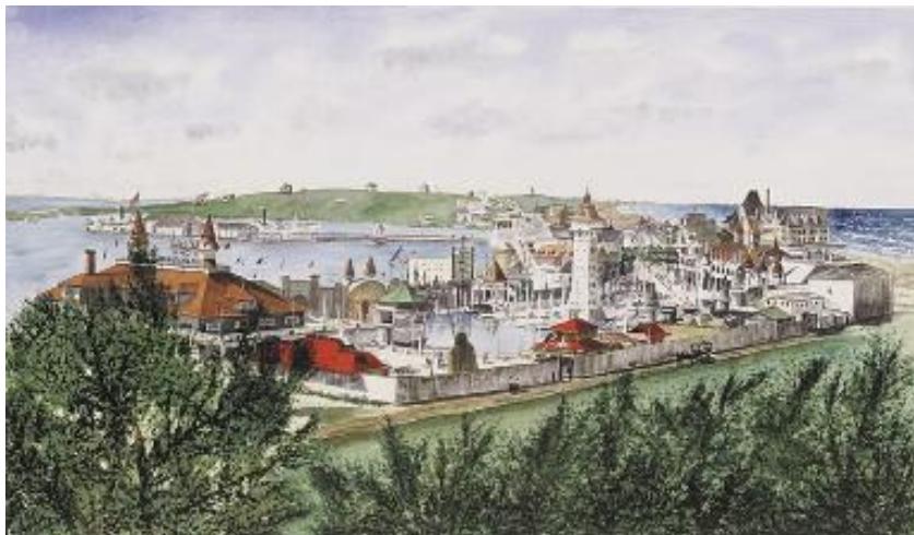
Paragon Park 1905