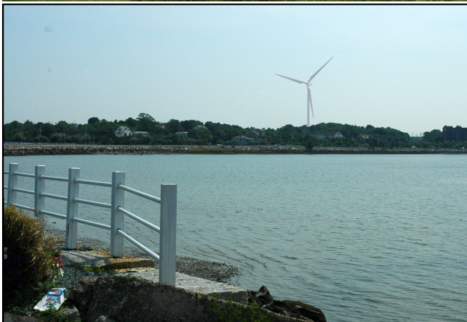
Photo Simulation of Hull 2 Wind Power Project

About the Project: Owner: Hull Municipal Light Project site: Town Landfill Turbine: Vestas V80, 1.8 MW Diameter: 263 feet (80 m) Hub height: 197 feet (60 m) Location: 42.26° N, 70.85° W